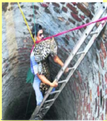
SAVING A LEOPARD FROM A WELL

“I am a Hindu because it is Hinduism which makes the world worth living.”